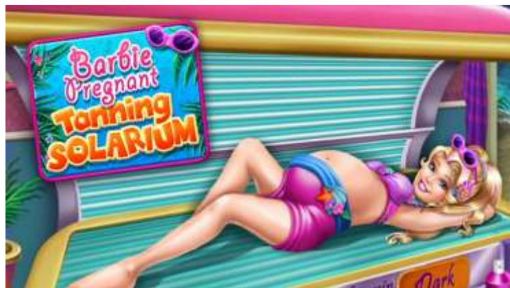
Figure 4 "Pregnant Tanning Solarium"

sabotaging one another in their attempts for the affections of male characters. Considering that the intended demographic of these games is (as the childhood character franchises and sparkly background seem suggest) young