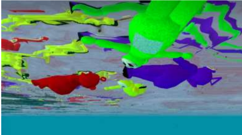
Figure 3 "Island of the Misfit Toys" (2015)

childhood narratives from the digital interface? Does our sympathetic reaction to