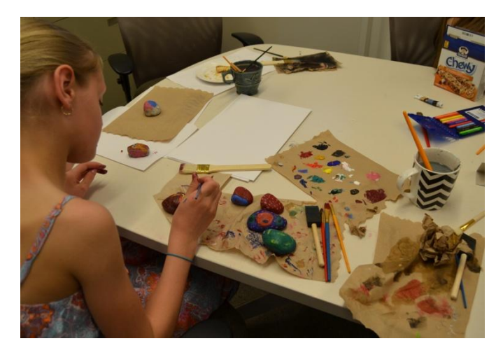
Young visitors to the gallery try their hand at creating art during the Children's Collage Summer Workshop Series, Summer 2013.